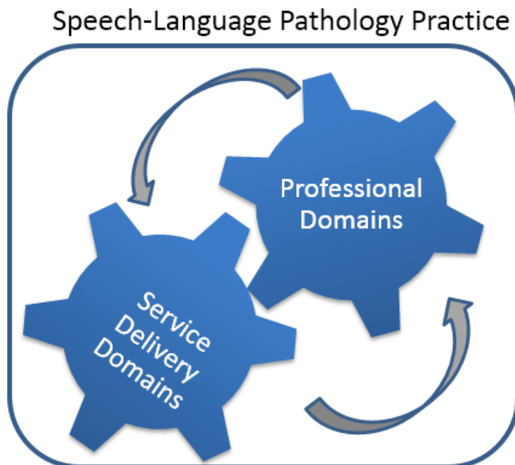
Figure 1. Schematic representation of speech-language pathology practice, including both service delivery and professional domains.